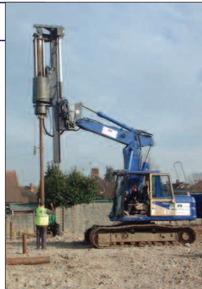
Top Drive Rig