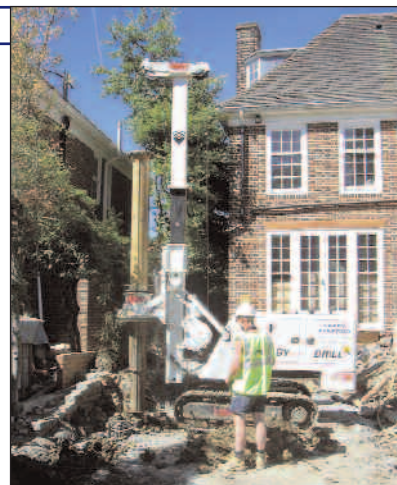
Mait Rotary Auger